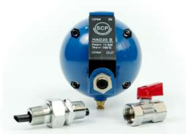
Automatic float drain (HAD20B) is fitted as standard on filters MS130 (2") and larger.