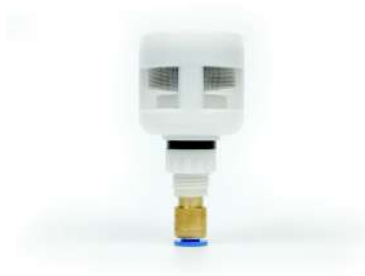
Automatic drain (SD01) valve is fitted as standard on filters MS020 (1/2") to MS070 (11/2").