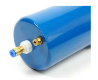
Manual drain (SD02) valve is fitted as standard on filter MS040 (3/4") and larger for rapid depressurisation and autodrain function check.